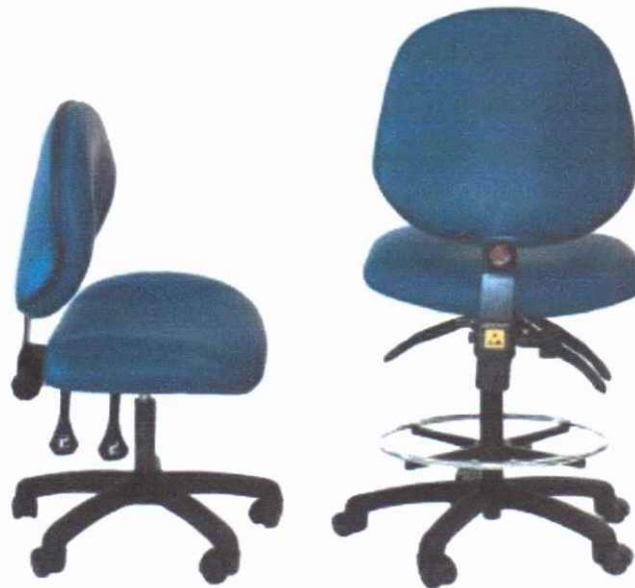
1000 SERIES SEATING

This report serves to document the testing of the above sample chair to all applicable test paragraphs of ANSI/BIFMA X5.1-2011, tests for general-purpose office chairs. Testing for complete certification was performed for this type of chair, classified by the standard's definitions as a Type III chair. The remainder of this report will show how the chair submitted for testing met the requirements needed for conformance to the standard.